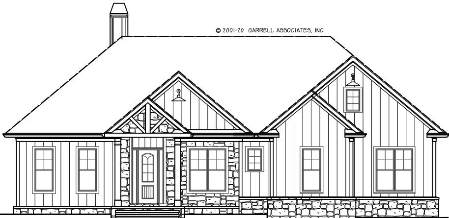
FRONT ELEVATION - B