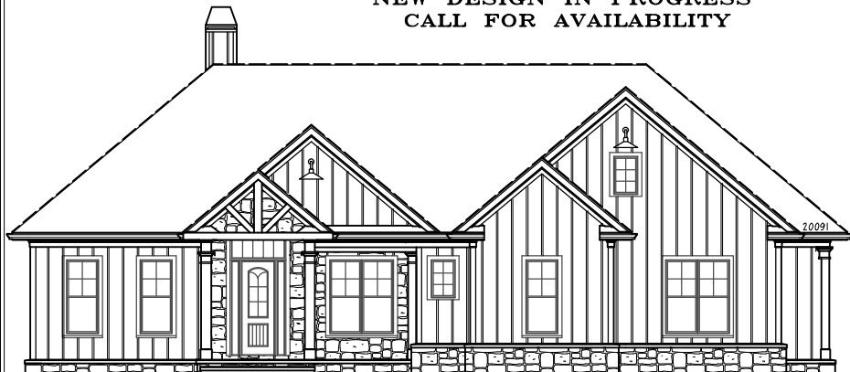
FRONT ELEVATION - B

NEW DESIGN IN PROGRESS CALL FOR AVAILABILITY